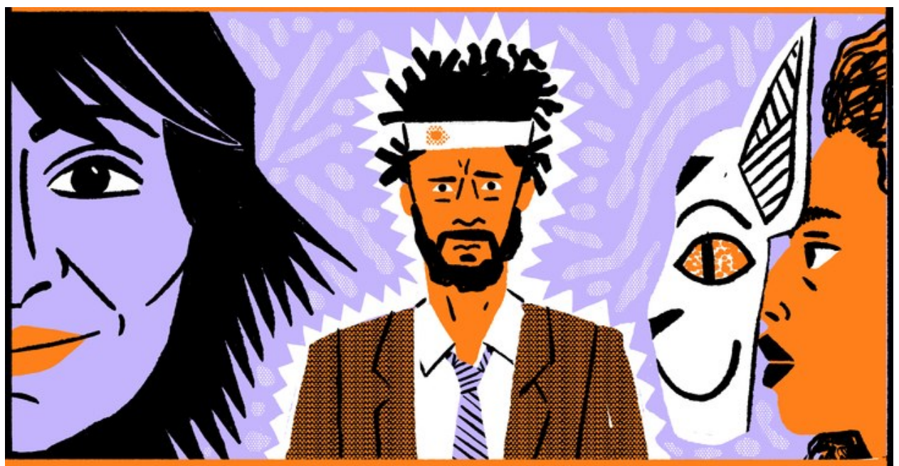
Illustration by Cari Vander Yacht